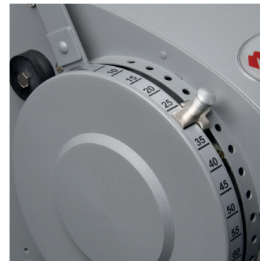
Fast Length Selection Quickly choose one of 15 preset tape lengths on clearly marked dial.