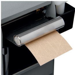
Superior Mechanics and Guillotine Blade Delivers clean, even cutting of reinforced and non-reinforced tape